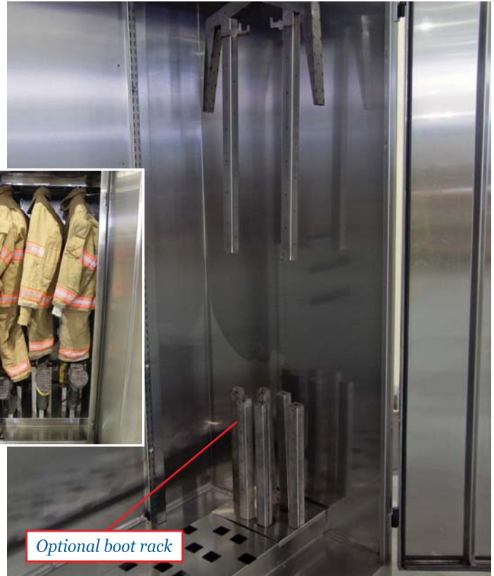
Optional boot rack

Insertion air tubes allow heated airflow to penetrate into the hanging jackets and bibs, providing superior drying performance. An optional boot rack can be inserted as tubes into the bib leg to increase directed airflow into the gear and speed drying time.